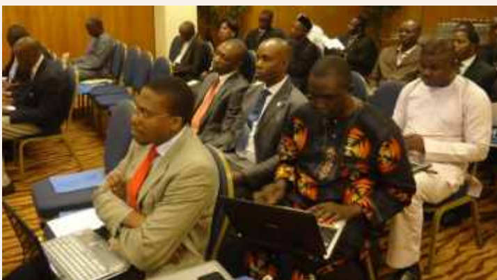
Participants at the Seminar