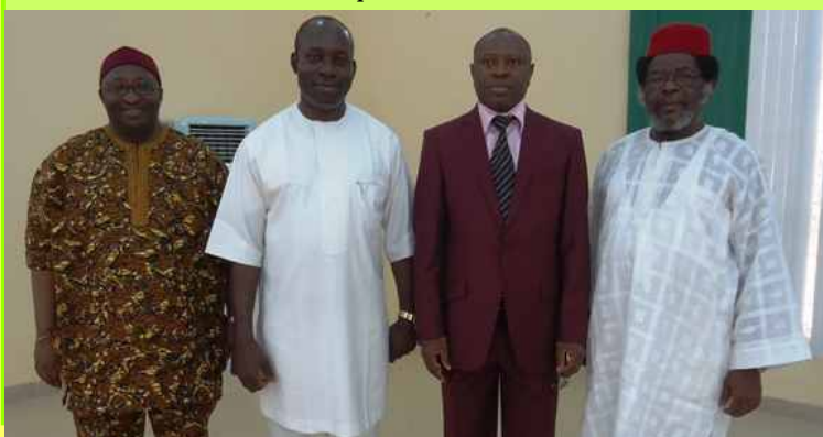
Members of the Board of Directors

For the second time in 2011, the meeting of the Board of Directors of the Institute was held on 4th November, 2011. While the first meeting was held on 28th February, 2011 at The Hotel premises, the second meeting was held for the first time at the Institute's Seminar Room. Decisions that will affect the continuous development of the Institute were taken.