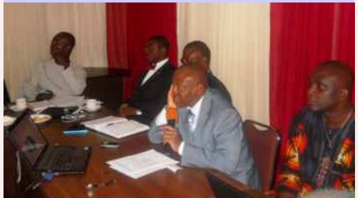
Participants at the Workshop, held in Abuja

As a follow-up to the seminar held on the future of middle class in Nigeria on the 4th of June, 2011, a feedback scenario workshop took place on the 24th August, 2011 at 3J's Hotels, Abuja. Participants at the workshop described the project as commendable, saying it is time middleclass takes its pride of place in Nigeria. There was a consensus that the current emergence of the class in Nigeria is critical to nation building.