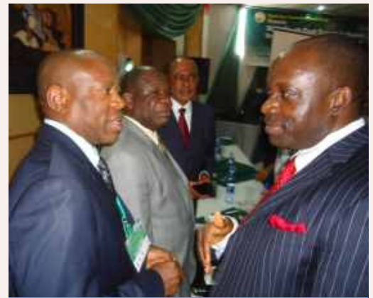
Distinguished guests at the Economic Summit

Eminent personalities who are indigenes of the South East zone who graced the occasion paid glowing tributes to AIAE for the onerous task so far done on SENEK, and therefore called on the South East Governors Forum to ensure the formal