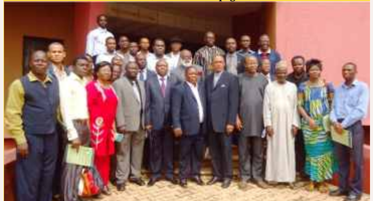
AIAE Team members and UNN staff pose for a photograph